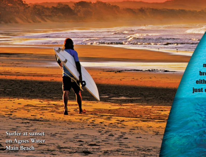
Surfer at sunset on Agnes Water Main Beach